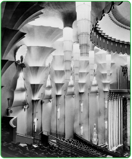
The New Victoria Cinema.

Originally constructed for Provincial Cinematograph Theatres (PCT) as an almost 3000-seat cinema, the venue was also intended to present live variety shows and therefore stage and orchestra facilities and some dressing rooms were included within the design. Uniquely, the building has two almost identical facades and entrances, one on Wilton Road and the other on Vauxhall Bridge Road.